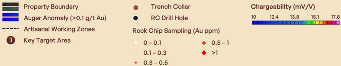
Figure 1: Target Daina 1 South, Chargeability trend with anomalies, rock samples, trenches, drill collars and artisanal workings.