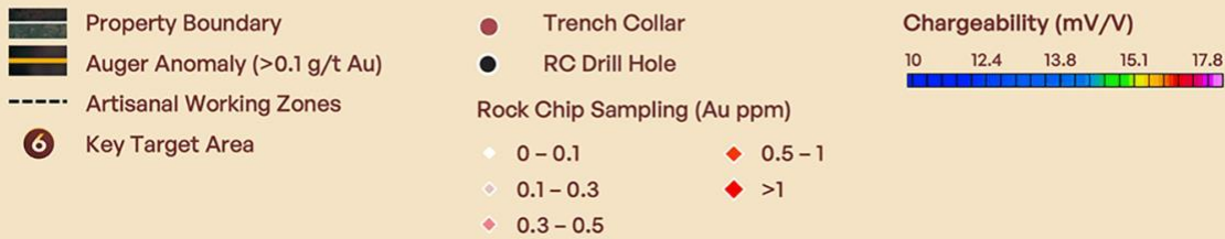
Figure 2: Target Daina 6 Chargeability trend with anomalies, rock samples, trenches, drill collars and artisanal workings.